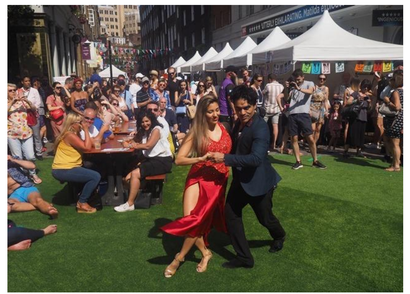
Tango Terra in front of community stalls.