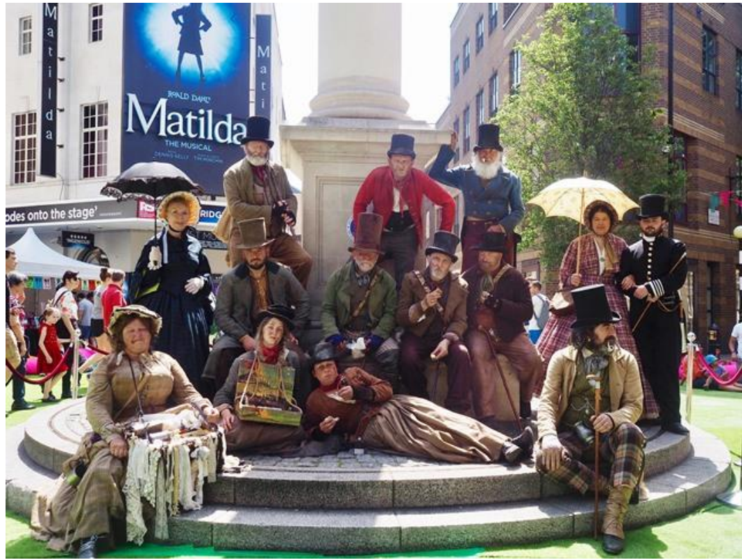
The Seven Dials Rapscallions.

Cllr Sabrina Francis Camden Deputy Mayor, Cllr Ruth Bush Westminster Lord Mayor and Sir Keir Starmer MP QC toast the Sundial Pillar and Princess Beatrix of the Netherlands who unveiled the Sundial Pillar in 1989. Mayor's cut the 30<sup>th</sup> anniversary cake at the reception.