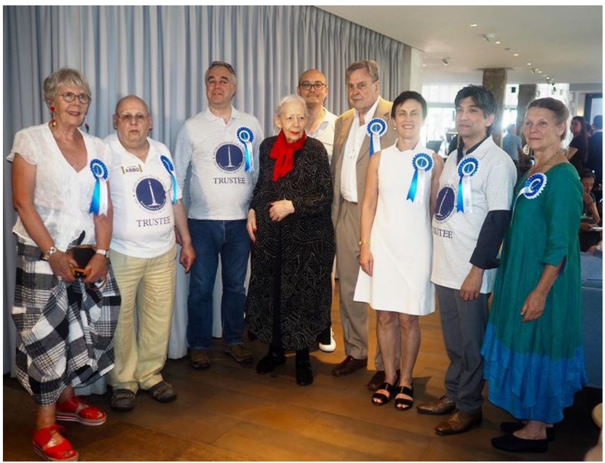
Trustees before the reception kindly sponsored by the Mercer Street Hotel.