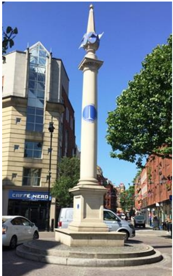
The anniversary roundel on the Sundial Pillar.