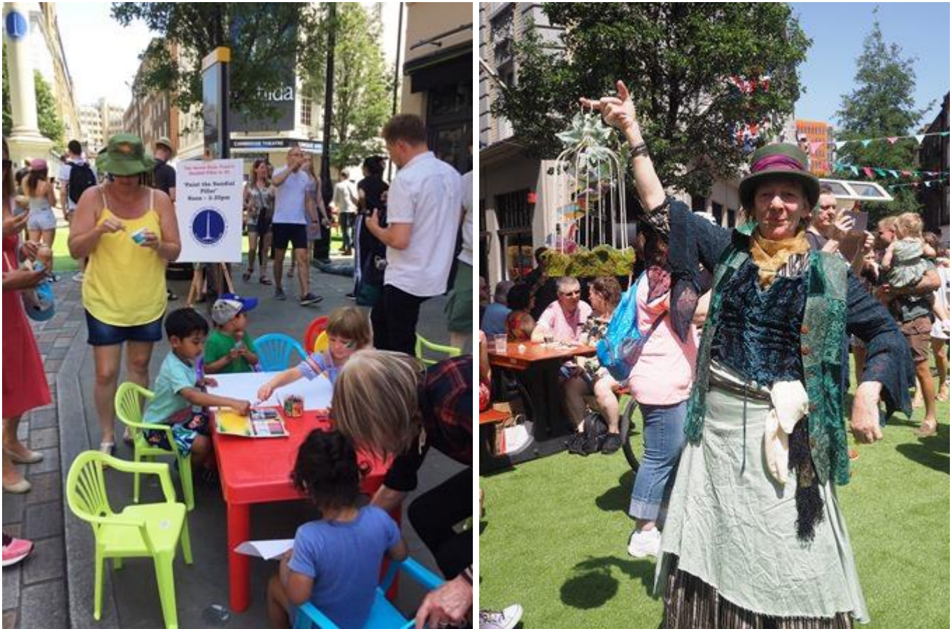
Paint the Pillar ( not available ); Bird Seller of Seven Dials reflecting the19c Bird Market in Monmouth Street.