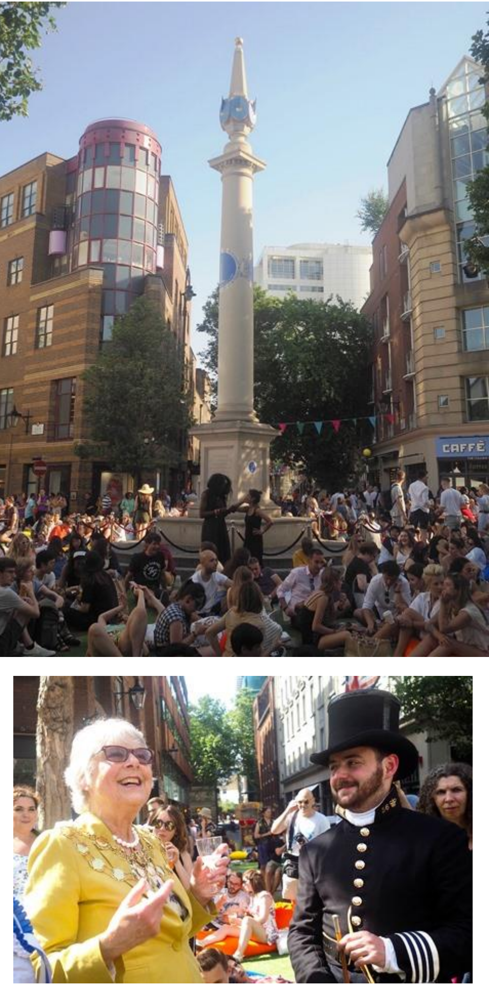
The Lord Mayor meets an 18c street beadle.