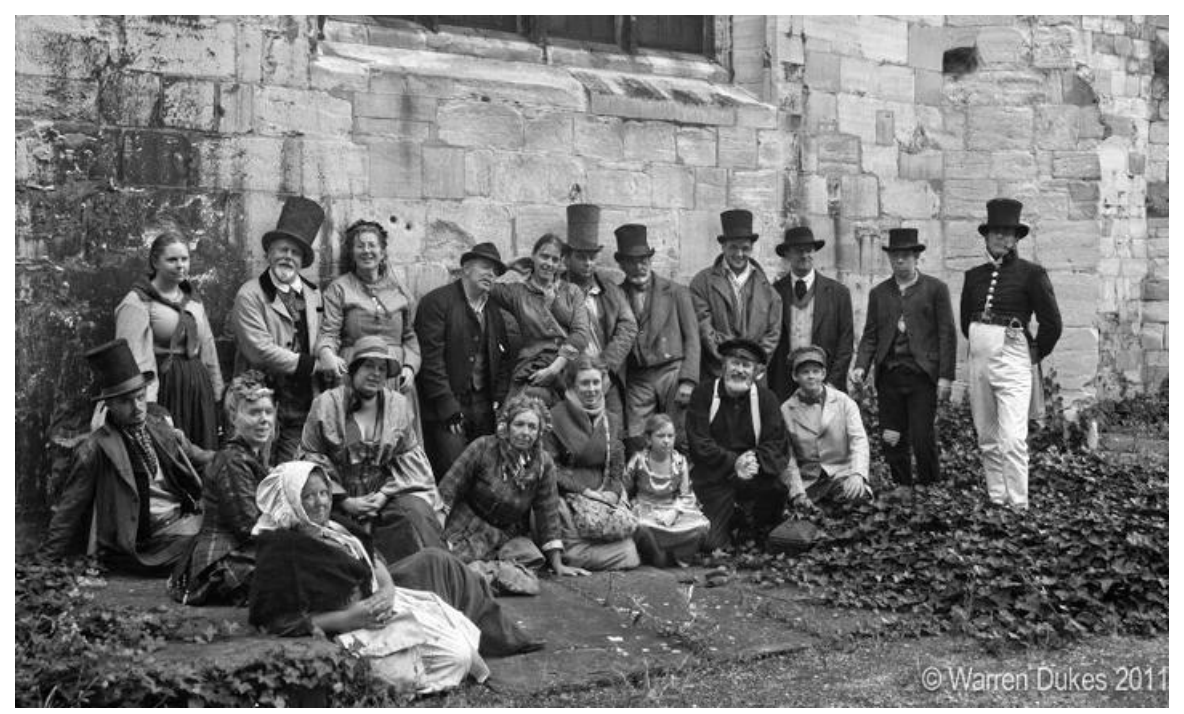
The Seven Dials Rapscallions