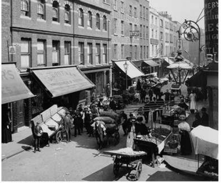
Earlham Street Market c. 1900.

To find out more about Seven Dials and the work of The Seven Dials Trust please visit: www.sevendials.com